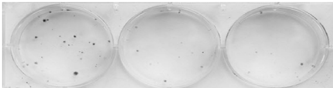
Figure 2: Colony formation in the MCF-7 cell line.